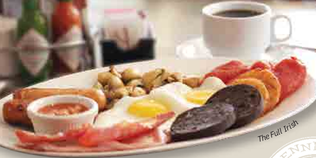
The Full Irish