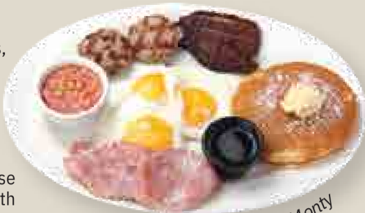
The Bennigans Full Monty

3 eggs as you like, pork bacon rashers, fried portobello mushroom, American style sausage, baked beans, 2 pancakes and choice of bread.